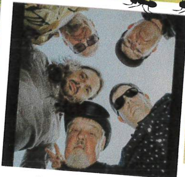
Another Side August 1 st - 7 - 11 pm