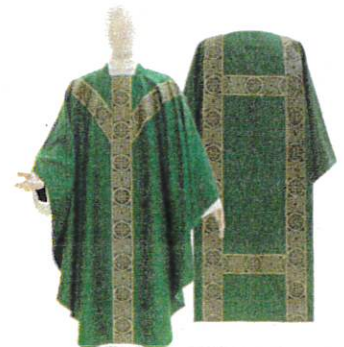
Vestments (dalmatics)** (Semi-Gothic, cream, red, rose, purple, green)