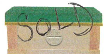
Altar Cloths** (cream, purple, red, green)