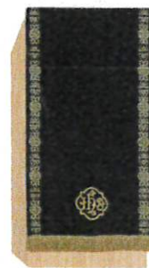
Lectern Hanging** (cream, red, purple, green) & Coronation