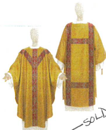
pictured: Holy Day chasuble and dalmatic Vestments (chasubles)** (Semi-Gothic, cream, red, purple, rose, green)