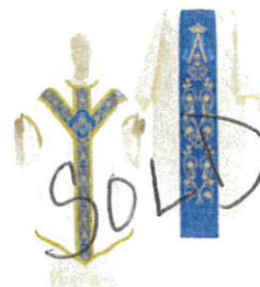
Vestments** (Marian Chasuble and Dalmatic)